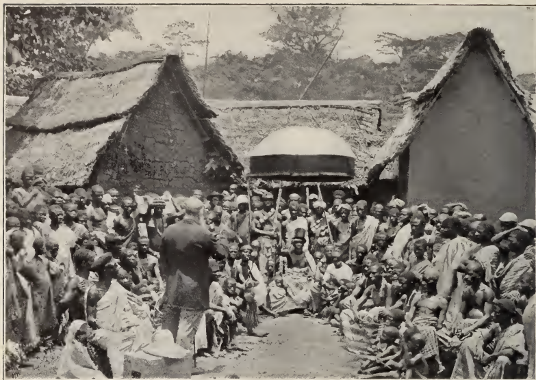
A 'CHRISTIAN MISSIONARY' PREACHING BEFORE AN AFRICAN CHIEF.